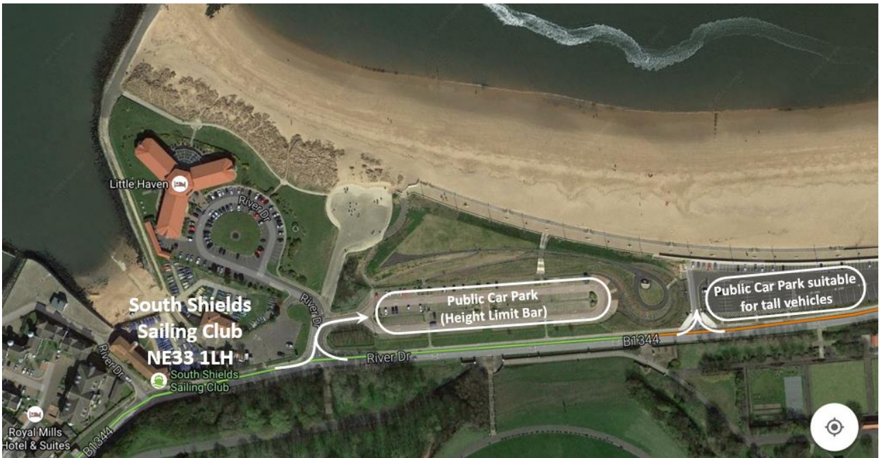
Figure 1 - Location of South Shields Sailing Club

Please avoid parking and rigging boats at the concrete turning areas at the top of the slipway. Please show consideration for other users and assist crews to launch quickly by bringing trolleys up the beach once their boats are launched.