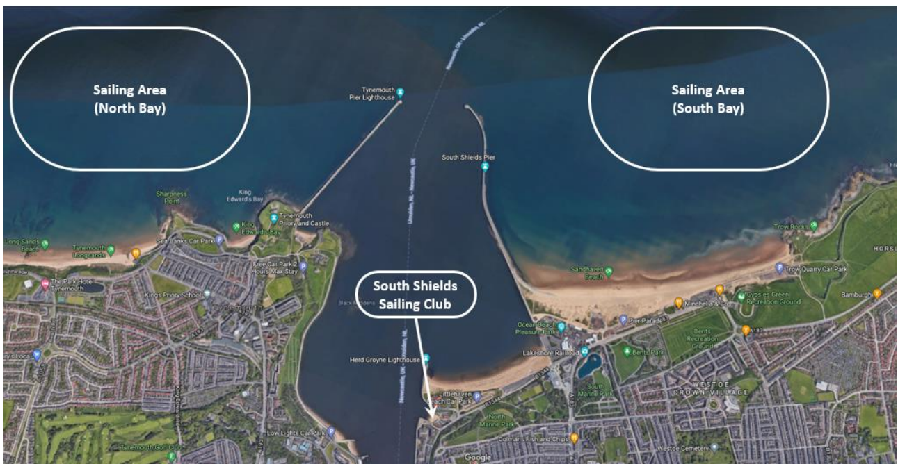
Figure 2- Sailing Area